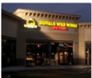
BUFFALO WILD WINGS