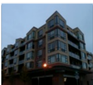
1620 BROADWAY BLDG